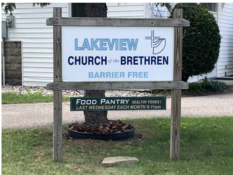
Lakeview Church of the Brethren: New Signage